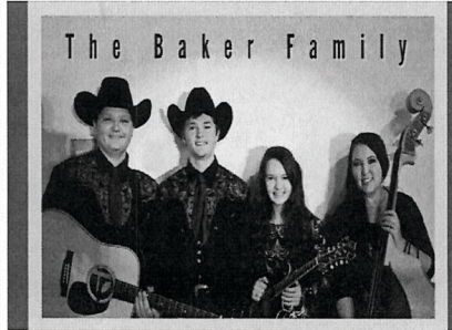
EXCITED TO WELCOME: THE BAKER FAMILY!