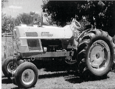
FEATURE TRACTORS: FORD