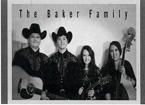
EXCITED TO WELCOME: THE BAKER FAMILY!