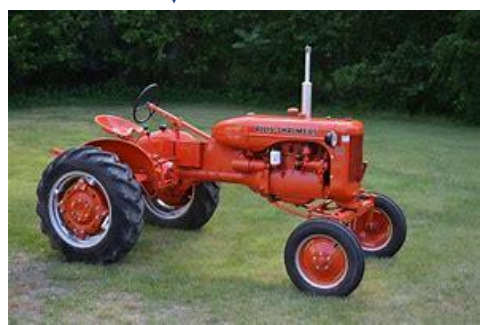
FEATURE TRACTOR: ALLIS CHALMERS