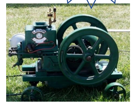
FEATURE GAS ENGINE: LAUSON

THURSDAY – MISSOURI FARM PULLERS 7:00 P.M. FRIDAY EVENING PARADE THROUGH DOWNTOWN MONTGOMERY CITY 6:00 P.M.