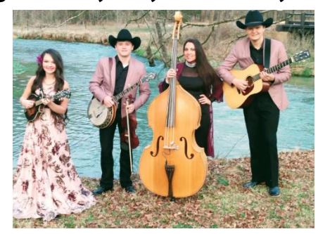
EXCITED TO WELCOME: THE BAKER FAMILY!